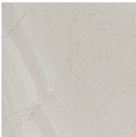
THAMES WHITE MATT RECT VC02913 60 X 60 CM (10.5MM)