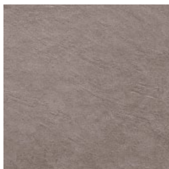
GREY VC01608 45 X 45 CM (10MM)