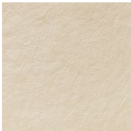
SILK RECT VC02234 60 X 60 CM (11MM)